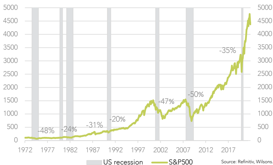
Figure 3: The (big) US bear markets have typically been accompanied by a recession (except 1987)

Based on history, a 20% correction may be the precursor to a genuine bear phase, but it may also represent the tail end of a correction phase typically followed by a significant rebound. We find the most common distinguishing feature between corrections or mild bear markets and the big US bears is the onset of a US recession. For the US market, 5 out of 6 of the big bears were accompanied by the onset of a US recession. The exception was the 1987 crash. The US market fell 31% peak to trough (including a 20% 1 day fall) but was not accompanied by a US or global recession. 1987 was a dramatic decline, but the US market did regain its previous high relatively quickly. The 1987 crash was a more harrowing experience for the Australian market, with a bigger fall and a slower recovery. The onset of an Australian recession seems less clear as a guide to the size of the bear market in Australia, with a US recession (or soft landing) usually the more important marker.